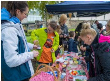
Community & Volunteers