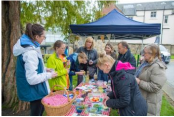
Food and Growing